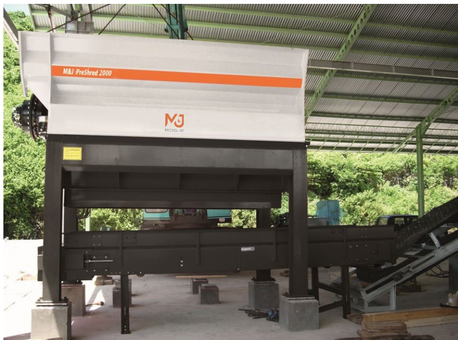
M&J PreShred 2000S