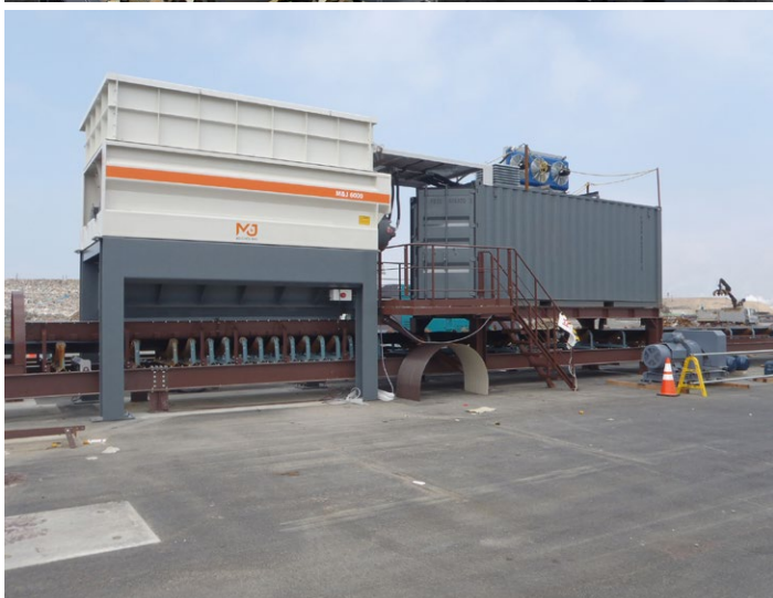
M&J PreShred 6000S