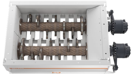
Cutting table K-210-7 knives