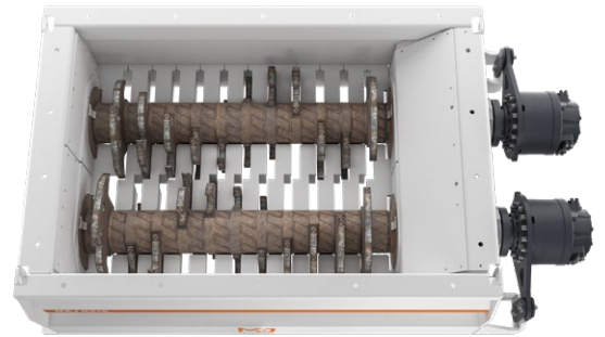
Cutting table K-210-11 knives