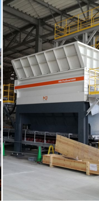
M&J PreShred 6000S

awkward items. A very large cutting table and the twin-shaft design handle shredding with no bridging problems and a consistent output flow.