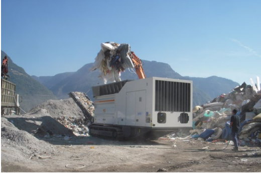
M&J PreShred 4000M

We offer both pre- and fine-shredders. Below is a short description of our solutions.